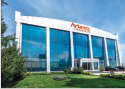
Istanbul Headquarter & UPS Factory

Aytemiz-Makelsan products are manufactured in Istanbul factories and all production process is monitored and developed according to ISO 9001 Quality Control System.